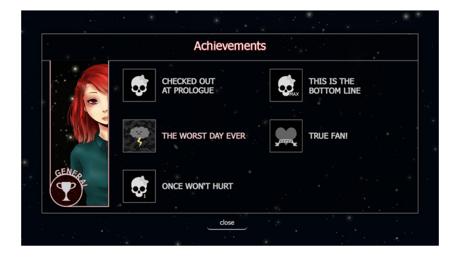
Reversion - The Return (Last Chapter) Ativador Download [Ativador]